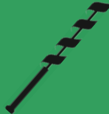
13mm Auger Bit