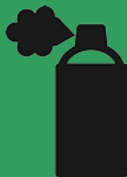
Expanding Foam & Gun